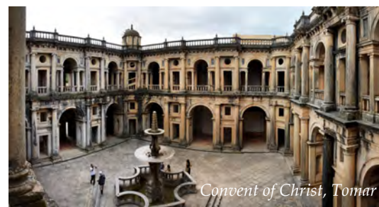
Convent of Christ, Tomar

Our bus will take us directly to Lisbon Portela International Airport, where we'll depart for Amsterdam and then onto Minneapolis and then back to Billings.