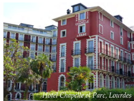
Hotel Chapelle et Parc, Lourdes

Just as every other day, we'll begin today with breakfast. We'll then participate in Mass followed by a walking tour of Lourdes. The tour includes the grotto where the Virgin Mary appeared to St. Bernadette in 1858, Our Lady of Lourdes Shrine, Bernadette's birthplace, and her family home. In the afternoon we will have time to go to the baths to wash our ourselves or perhaps to spend some time in quiet prayer. After such a blessed day we will come together again for dinner at a restaurant near the hotel.