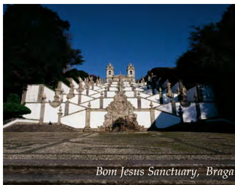
Bom Jesus Sanctuary, Braga