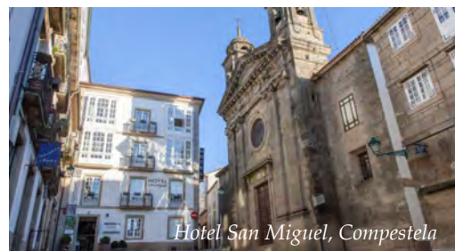
Hotel San Miguel, Compostela

Today is a day set aside for prayer. Mass, Eucharistic adoration and the rosary are among the activities planned for the day. How blessed we will be; actually there at the site of the Blessed Mother's apparitions to the three shepherd children, Lucia, Francisco and Jacinta!